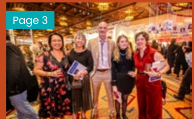
Heartfelt success: Celebrating 2024 Sweetheart Auction