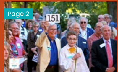
Celebrating a decade of vision: 10/10 Visionary Fund