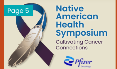
Save the date: Native American Health Symposium