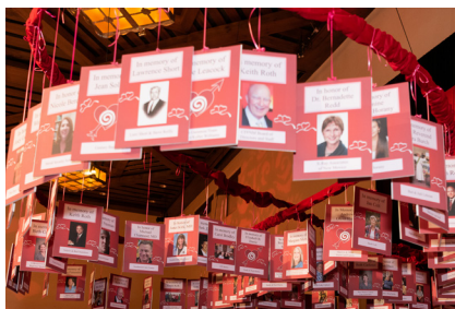
The Sweetheart Auction Honor Wall