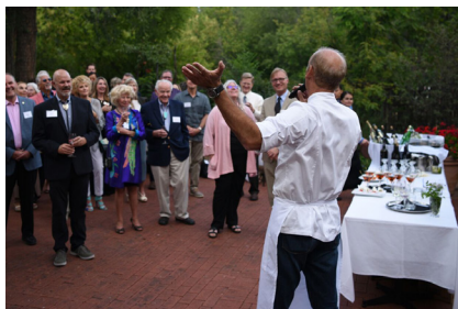
The Supper Club at The Compound Restaurant